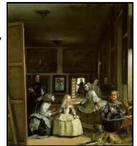
"Las Ninhas" by Diego Velázquez

brated in the royal courts. In the 20 th century due to World Wars there was no employment for little people and so they had to find means to survive as midget entertainers. That's also when there was a sport created called midget tossing and I think the name of the sport speaks for itself. In June 2003 there was a Legislative Act in Canada that banned midget tossing because it was so dangerous and so inappropriate. In the 70's there was a sport called midget wrestling that even though was a source entertainment, many little people wrestlers have severe back problems and are now in wheel chairs due to this sport. So you can see through the centuries, little people went from being important figures, to being degraded, and now becoming more accepted in society.